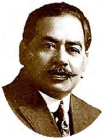
Jonah Kuhio Kalaniana'ole The Citizen Prince 1871-1922